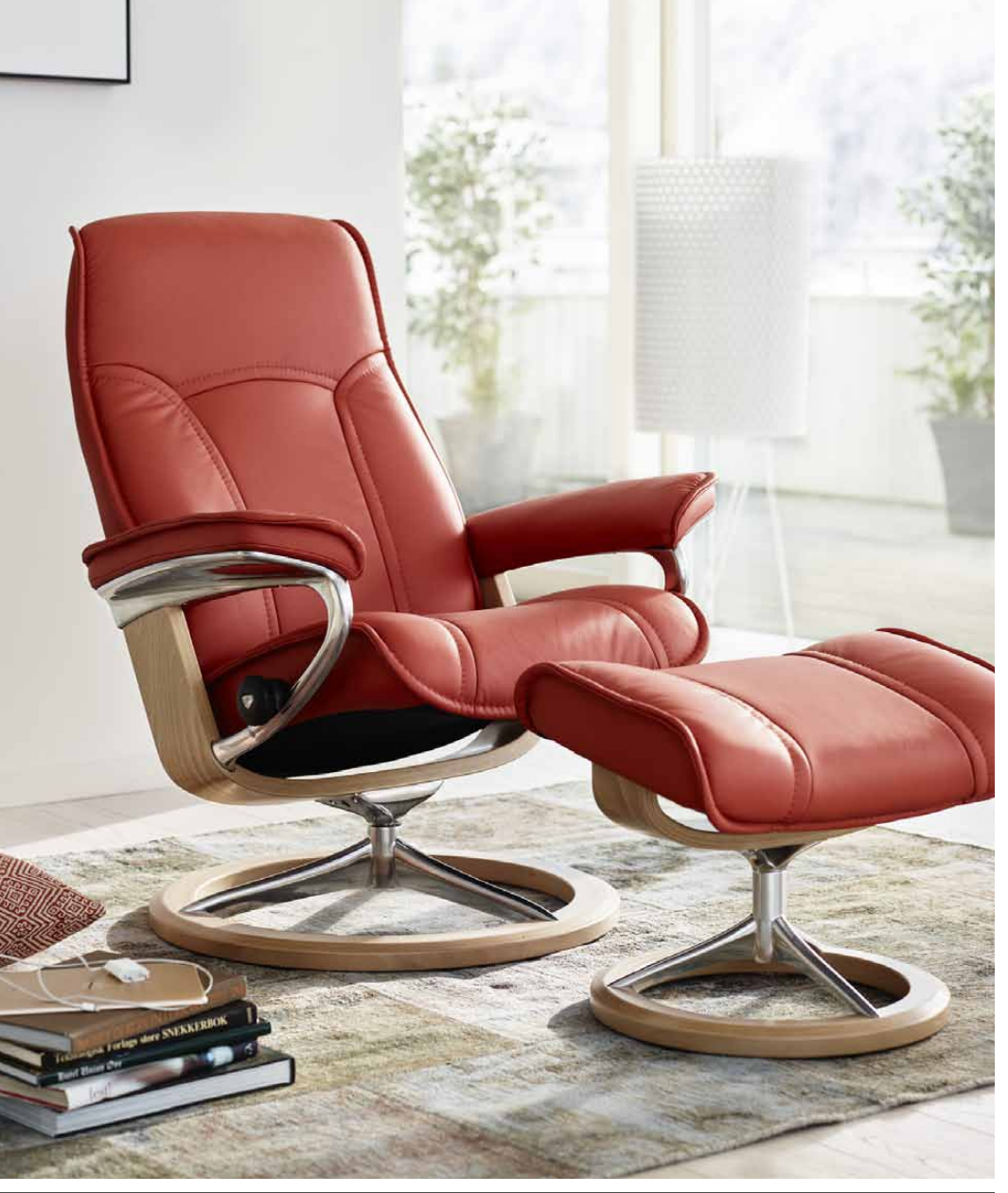
Stressless<sup>®</sup> Senator Medium with Signature Base is shown in Paloma Henna/Oak.