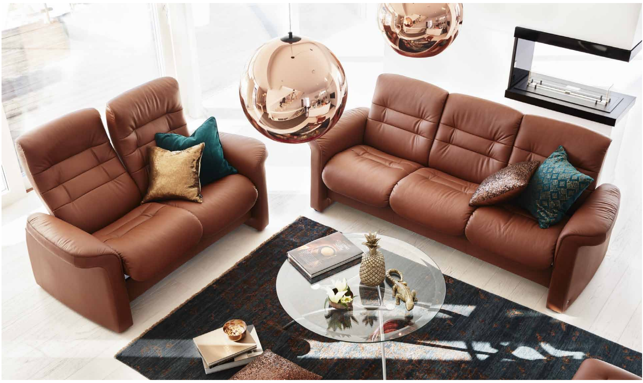
Stressless® Sapphire Sofa shown in Paloma Copper with Stressless® Enigma Table.